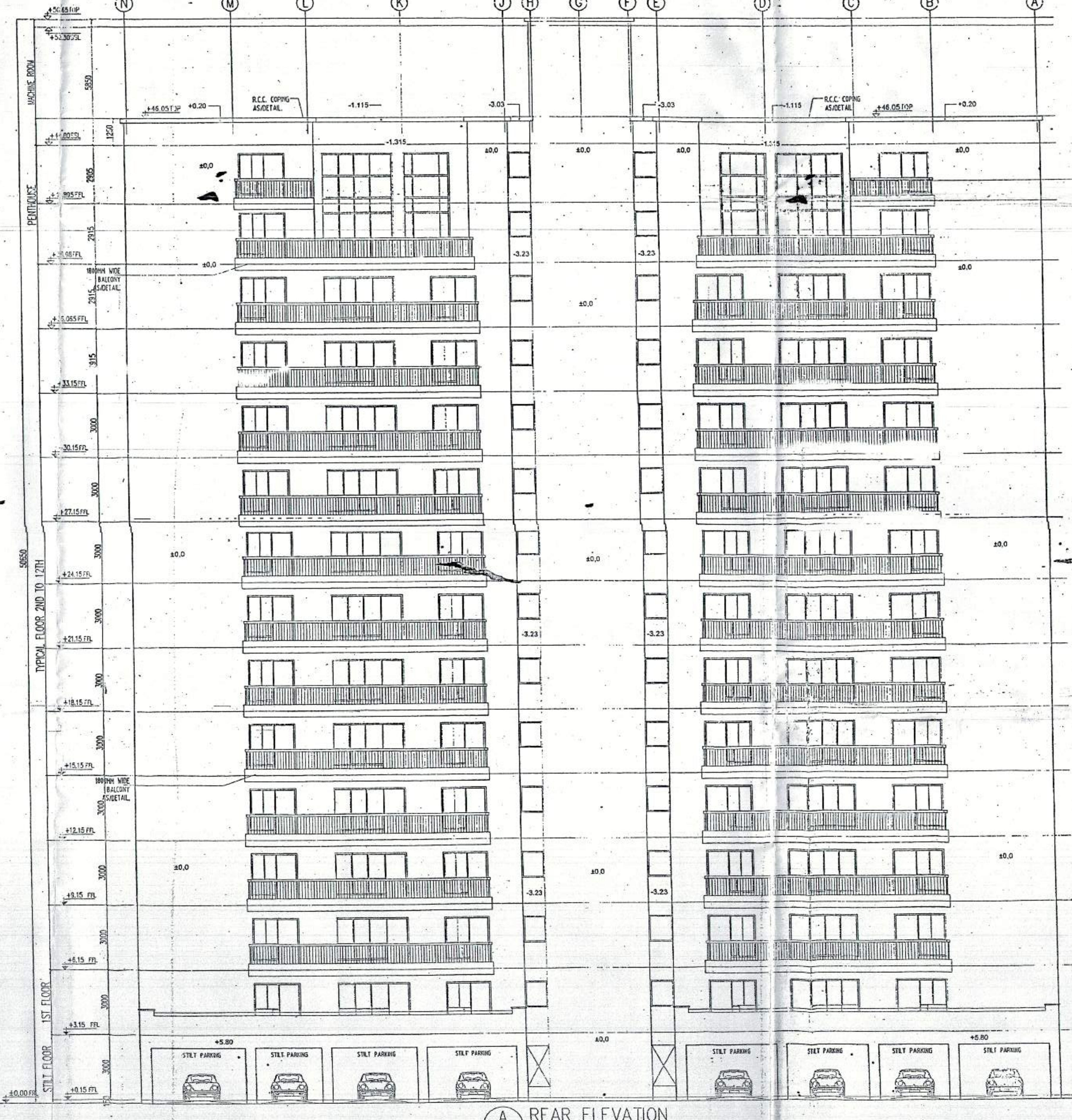
REAR ELEVATION (SCALE 1:100)