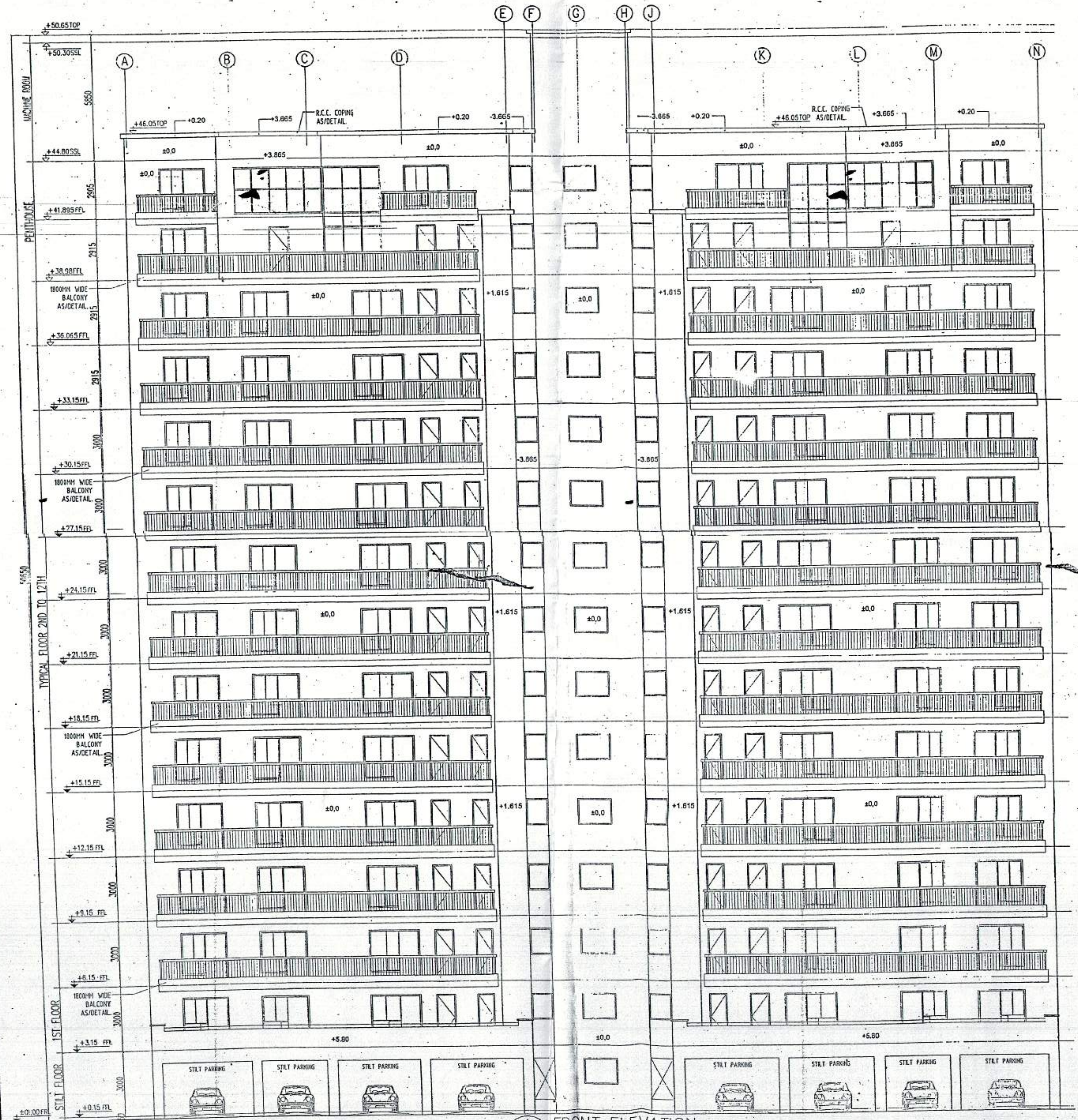
FRONT ELEVATION (SCALE 1:100)